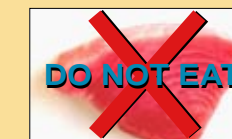
Tilefish (Gulf of Mexico) Commercial Fish (fish you buy)