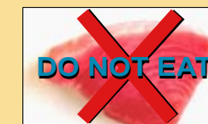
King Mackerel Commercial Fish (fish you buy)