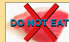
Shark Commercial Fish (fish you buy)

Do Not Eat! Women of Childbearing Age and Children - do not eat these fish