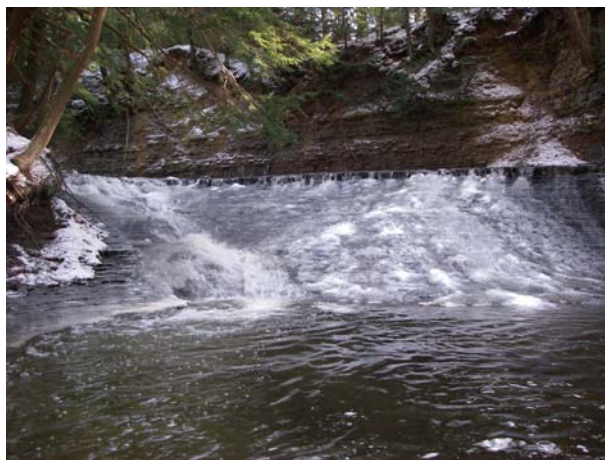
Figure 3. Fish migration barrier on Wiley Creek