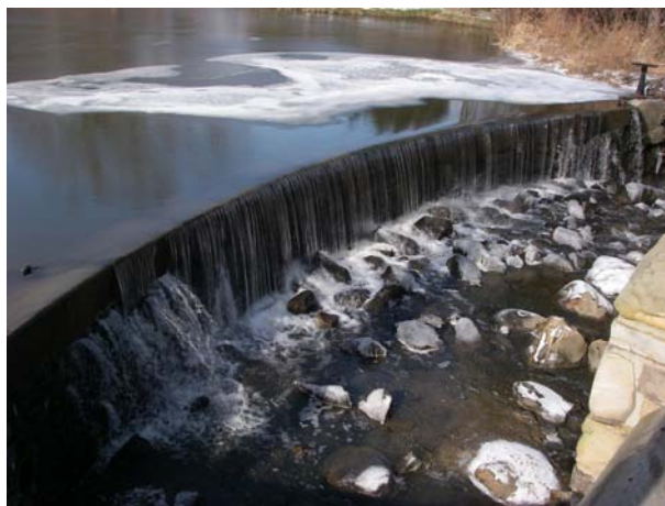
Figure 2. Dam on Pepper-Luce Creek

The site on Wiley Creek received the highest QHEI score of any site evaluated and should be capable of supporting an exceptional warmwater habitat community. This was not found to be occurring, as the electrofishing survey resulted in IBI score that rated only Poor . Although this site is designated coldwater habitat, no species associated with such a designation were collected. The site also had the second-lowest number of fish found at the headwater sites. These results, in conjunction with the predominance of highly pollution-tolerant fish and lack of more sensitive species found at this location, indicate possible water quality impacts impacting the fish community. However, natural barriers to fish migration downstream of the site may be more of an impediment to a healthier fish population (Figure 3).