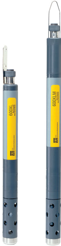
The YSI 600XL and 600XLM