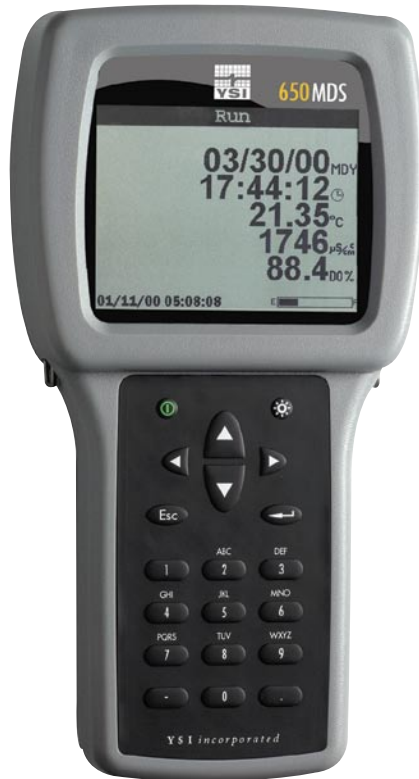
The YSI 650 Multiparameter Display System

Easily log real-time data, calibrate YSI 6-Series sondes, set up sondes for deployment, and upload data to a PC with the feature-packed YSI 650MDS (Multiparameter Display System). Designed for reliable field use, this versatile display and data logger features a waterproof IP-67, impact-resistant case.