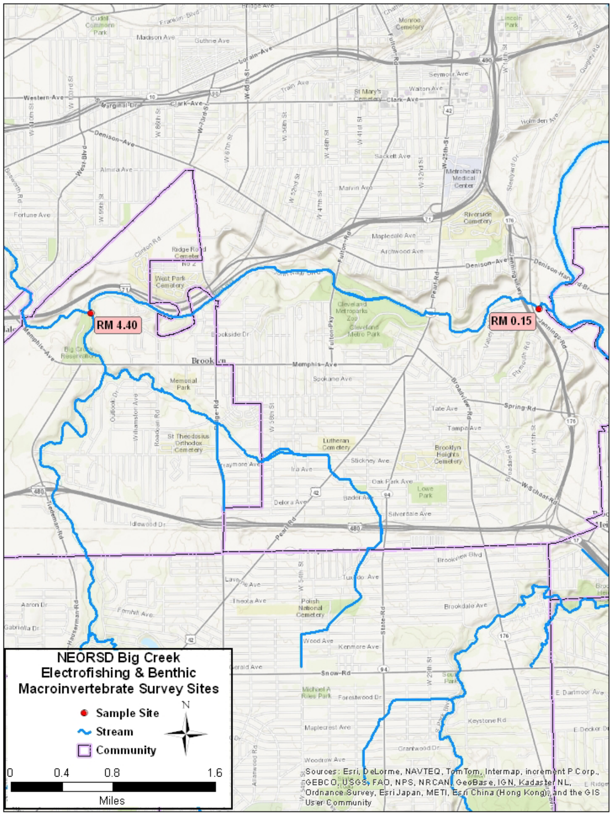
Figure 1. Map of sampling zones at RM 0.15 and 4.40 in Big Creek