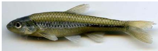
Bigmouth shiner ( Notropis dorsalis )

Prepared by The Water Quality and Industrial Surveillance Division