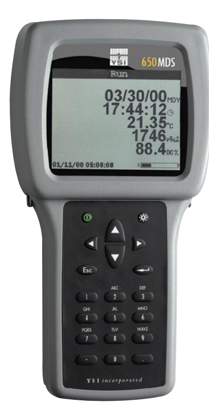
The YSI 650 Multiparameter Display System