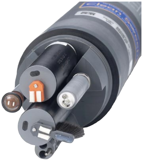
Profile of the 6600EDS depicting (clockwise from bottom) temperature/conductivity, turbidity, Rapid Pulse™ dissolved oxygen, chlorophyll and pH/ORP—all of which (except conductivity) are kept free of fouling by the patented Clean Sweep® universal wiper assembly, as well as individual optical wipers.