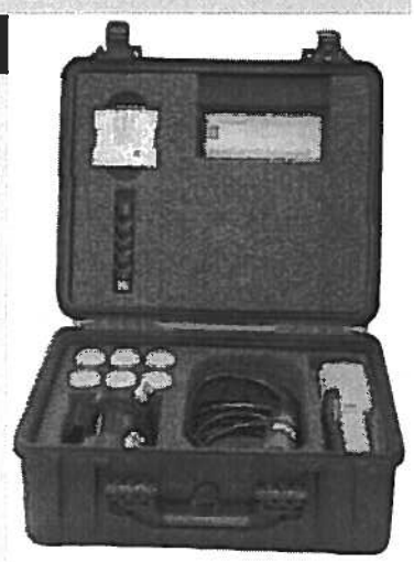
The 5080 carrying case with 556, 5563-4 cable, and 5083 flow cell.