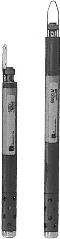
The YSI 600XL and 600XLM