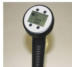
Flow probe digital readout display