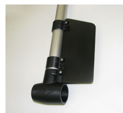
Flow probe prop housing with optional alignment fin.