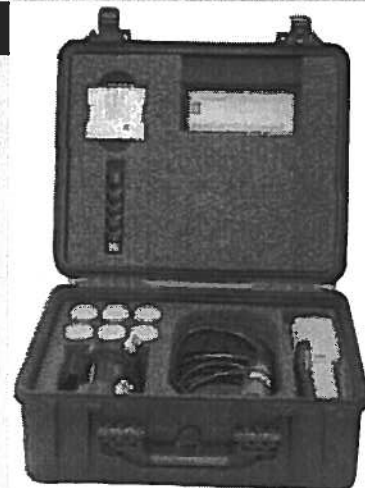
The 5080 carrying case with 556, 5563-4 cable, and 5083 flow cell.