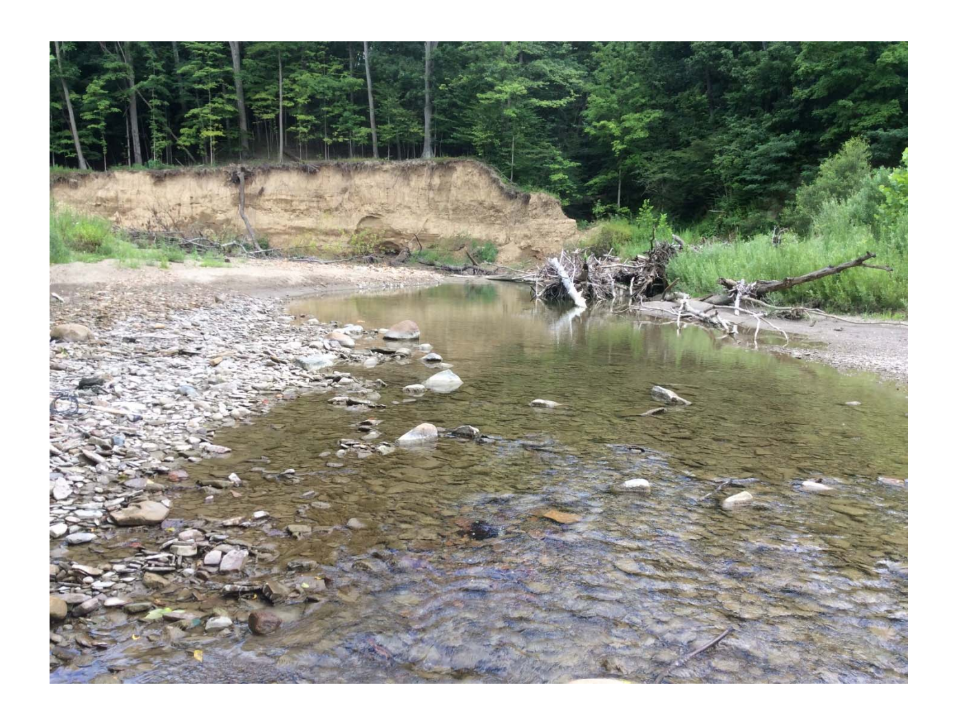
Prepared by Water Quality and Industrial Surveillance Division