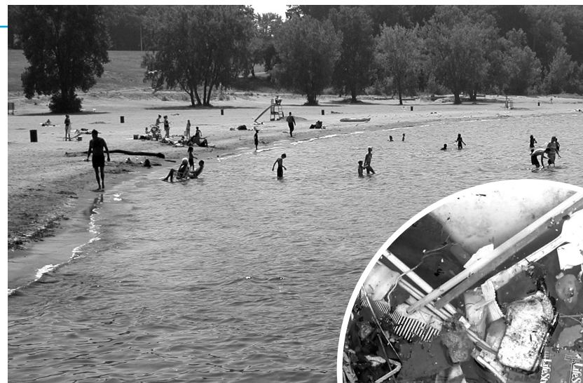
An example of what ends up in the water after a combined sewer overflow.

Sewage discharges totalling over 4.5 billion gallons a year seriously compromise the quality of our streams, river, and Lake Erie. After it rains, beachgoers are often advised not to go swimming in Lake Erie due to elevated bacteria levels.