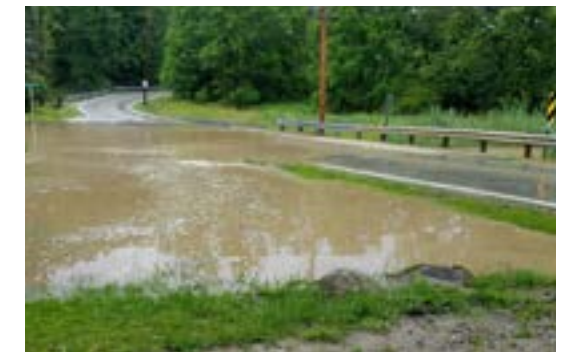
Riverview Road flooding