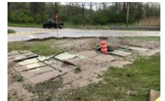
Sediment vaults surcharging